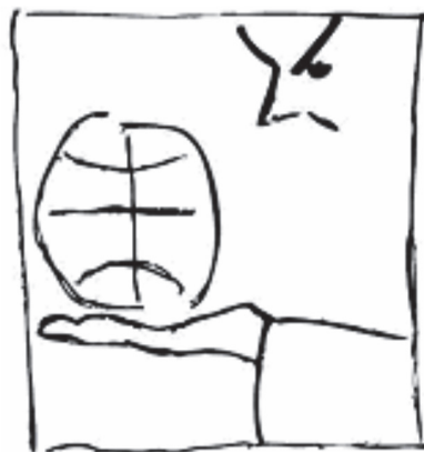
The author's figure

The New Renaissance is not far away – its symptoms burst everywhere and the steps of approaching of a New Man, the Man of action, the Creator and harmony are already caught